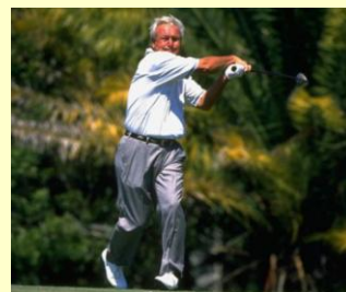
Arnie in action

Our last night was at golf legend, Arnold Palmer's Bay Hill Club & Lodge, 9000 Bay Hill Blvd., Reservations: 407-876-2429, www.bayhill.com where they are celebrating their 50th anniversary. Palmer's PGA MasterCard Invitational had just concluded, won by one stroke by Martin Laird, http://www.arnoldpalmerinvitational.com/ the first European to win in its 33 year history.