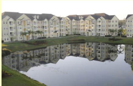
Magical Memories condos

We also stayed at a condo run by Magical Memories. These condos are quite spacious, 2-bedrooms, washer-dryer, kitchen etc., & can be had for as little as $65 per diem.