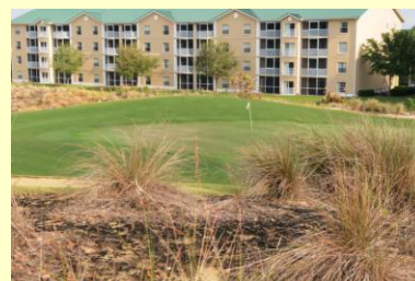
Mystic Dunes Course

Prior to this, we stayed at Mystic Dunes Golf Club & http://www.mysticdunesgolf.com/ Resort with special rates for bloggers.