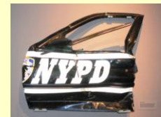
9-11 Museum exhibit

More interesting travel facts are available at: http://www.whattravelwriterssay.com/indexdiyoudknow.html