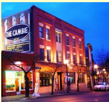
Mike Keenan: Bar Scene

YouTube: http://www.youtube.com/watch?v=IFnvc1H5_IQ http://www.youtube.com/watch?v=nGPjQzefiTU&feature=related ; http://www.youtube.com/watch?v=VdPqwzWeP1c