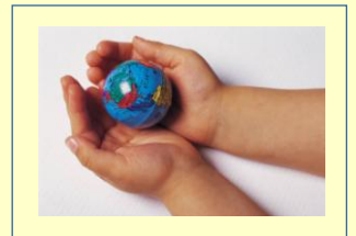
Earth in the palm of your hand

The Sheraton Centre is mere steps away from the Eaton (indoor shopping) Centre, close to opera, theatre and Blue Jay baseball.