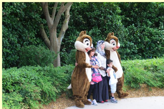
Large animal friends