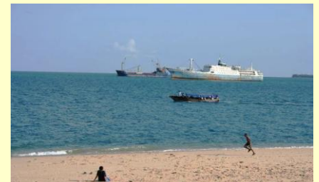
Zanzibar Beach, Stone Town by Beth Poad

More interesting travel facts are available at: http://www.whattravelwriterssay.com/indexdiyounow.html