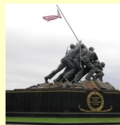
Iowa Jima Memorial

If you have additional travel tips that you would like to share with others, please send them to us for inclusion on our site.