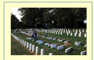
Arlington Cemetery 25 graves dug each day