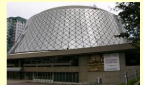
Roy Thompson Hall

More interesting travel facts are available at: http://www.whattravelwriterssay.com/indexdidyouknow.html