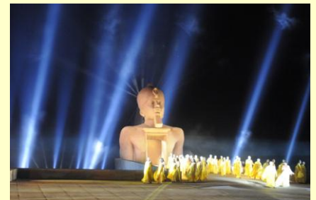
Aida Performance at Masada

More interesting travel facts are available at: http://www.whattravelwriterssay.com/indexdiyoknow.html