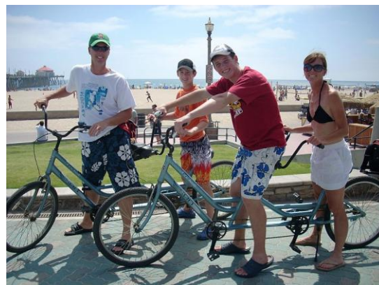
The Family - on rented tandem bikes at Huntington Beach, CA