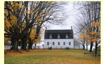
Shaker Meeting House

More interesting travel facts are available at: http://www.whattravelwriterssay.com/indexdiyoudknow.html